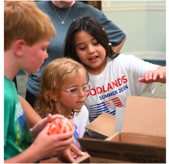
Collaboration at Kids Studio: Fiber Arts Weaving

The prize books also make a big impact as one patron shared, "Thank you for the prize books. I'm so glad you do this. This is the only way I can afford to get books right now."