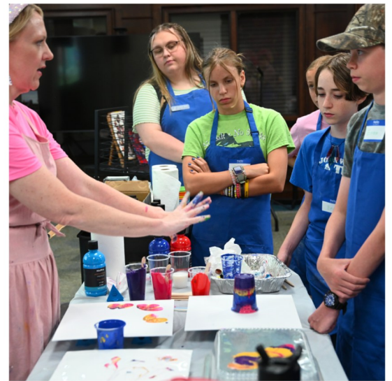
Teens experiment with paint pours