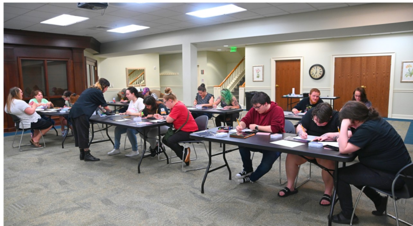
A nice turnout for BCPL After Dark: The Art of Tattoo