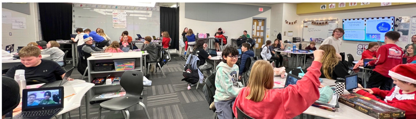
Family Stories at Boyle County Middle School