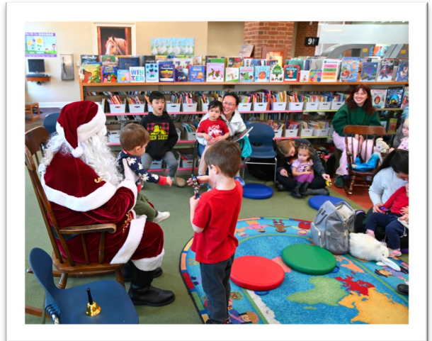
Santa delivers smiles to Storytime

Our most viewed social media posts by far came from Pictures with Santa, and a post displaying the library's Christmas décor was right behind those.