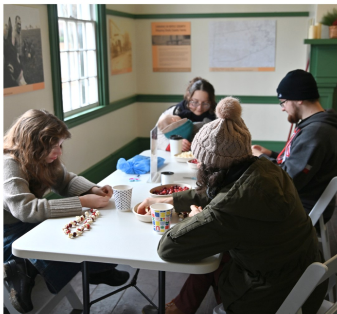
Historic Holiday Décor at Grayson's Tavern