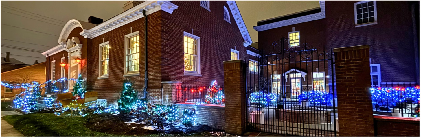
A colorful light show on the corner of Third and Broadway

Library spreads cheer to all corners of the county