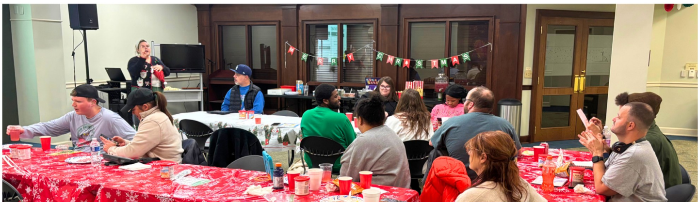
ASD Holiday Party in the Community Room