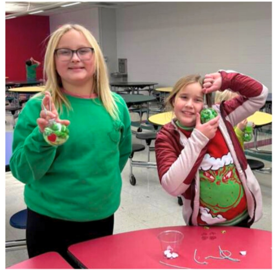
At Junction City Elementary School