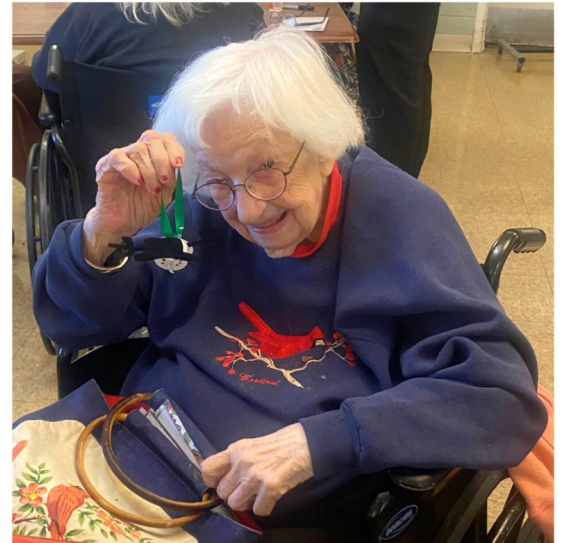
Snowman craft at Henson Park