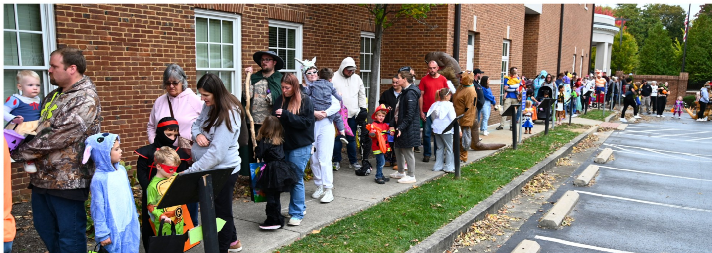
Long lines formed for library trick-or-treating and a dinosaur encounter!

Patrons join the library for a spine-tingling good time