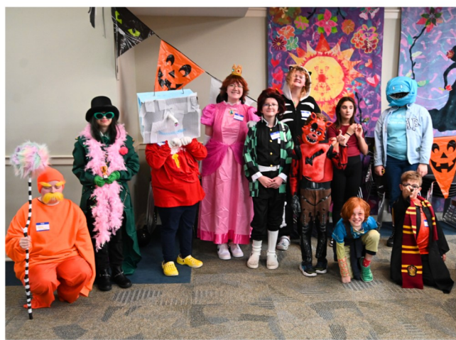
Teens enjoy a costume contest at YA Super Gaming Guild!