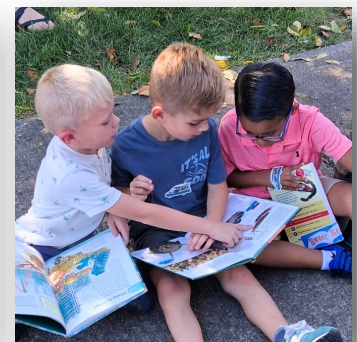
Engaged youth at visits to Junction and Woodlawn