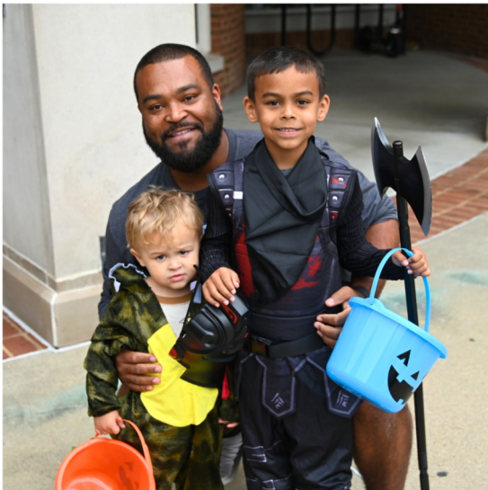
Above: All smiles at our annual Library Trick-or-Treat evnt!