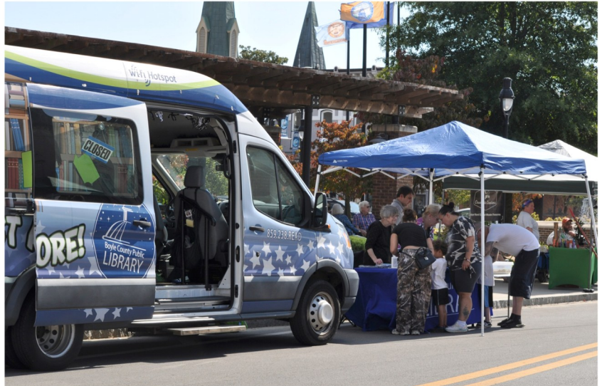
Outreach brings the bookmobile to Art Center Fall Fest

Outreach attended family nights at Hogsett and Bate, represented the library at Woodlawn Elementary School's Community Helpers Day, resumed their bookmobile stops with Woodlawn's reading intervention students, and, along with Youth Services, began a book club with Junction City Elementary students.