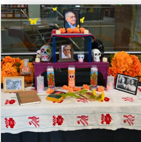
Left: Student ofrenda honoring Colombian writer and journalist Gabriel García Márquez

Our most-viewed Facebook post in October featured a collection of photos from Library Trick-or-Treat, followed by a photo of an impossibly cute Pillsbury doughboy from Baby Storytime that teased more photos on Instagram, a Trick-or-Treat announcement and a photo/video post from the installation of the digitization station at Forkland.