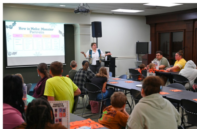
A large crowd on hand for Family Craft Night: Monster Portraits!