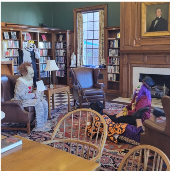
Clowning around in the Reading Room

Attendance at Behind the Screams, the festivals, and one-off school appearances led to us providing programming for 978 people across eight events.