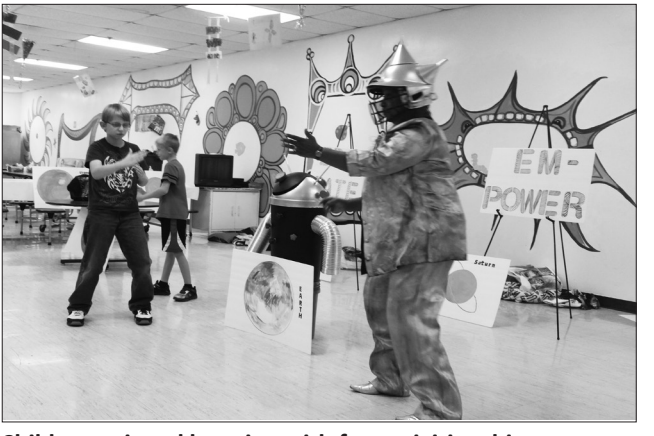
Children enjoyed learning with fun activities this summer.

nered with the Summer Feeding a position at Alvaton Elementary this summer community and $2,000 from Friends of program to engage children in School in Warren County. Both outreach program came the Library. from a DANA Foun-