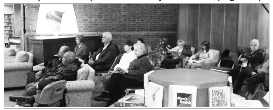
Audience enjoying concert by FIVE jazz band.

siastically. We evidently still did not tinely hold 30-40 programs per