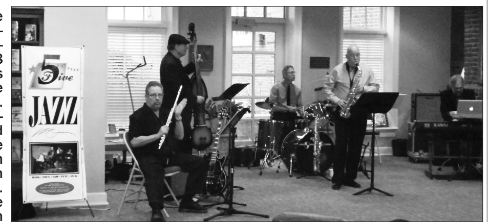
preliminary drawings to consider. To celebrate the fifth anniversay of the new building and expanded Library, jazz group FIVE performed on January 11th.

campus was offered For Sale, the that our facility and its operation planning committee gradually have far exceeded any hopes we became convinced that whatever had during the eleven years of plangoals it had for an enlarged facility ning. Going from 275 patrons per involved using that land. Nothing day in 2009 to 468 per day in 2014 was easy, however, and we did not was not in our vision. Increasing buy the property for nearly two more years. In 2005, the architectural firm of Pearson & Peters presented range expectations. drawing which were received enthu- We had no idea that we would rou-