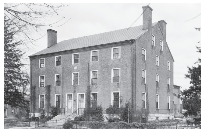
East Family Dwelling House circa 1940 as it appeared prior to extensive restoration of Pleasant Hill buildings that began in 1961.